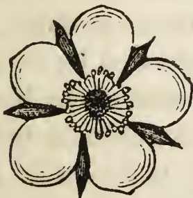
Staminate or Male Blossom.