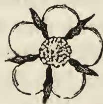
Pistillate or Female Blossom.